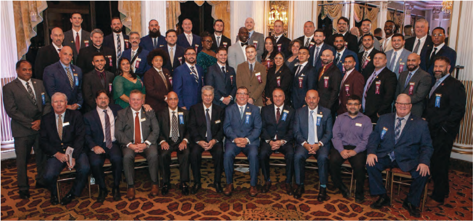
JATC, Local No. 1, and the Association of Contracting Plumbers (ACP) at Local No. 1 JATC Apprenticeship graduation ceremony

On November 9, 2023 a ceremony was held in New York City to acknowledge apprentices who graduated from the apprenticeship program jointly administered by the Association of Contracting Plumbers of the City of New York (ACP) and U.A. Plumbers & Gas-fitters Local Union No. 1. This five-year apprenticeship program is approved and overseen by the New York State Department of Labor (DOL).